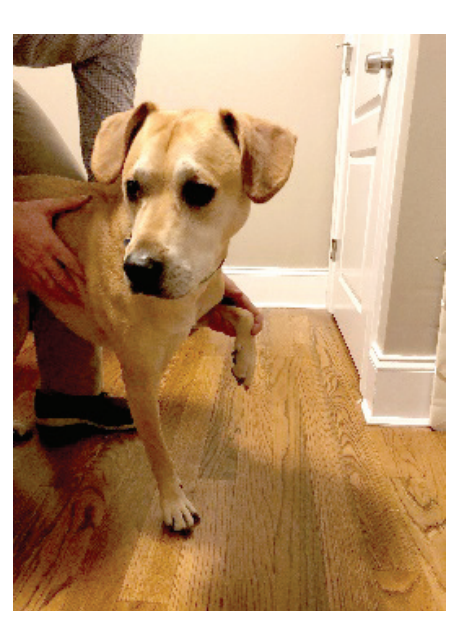
Figure 3. Single leg stance for stabilization.