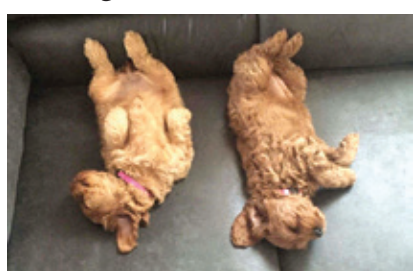
Rizzo & Frenchy enjoying the day from a different perspective!

"Yep, The World Still Looks The Same Upside Down, & No Change In Blood Pressure"