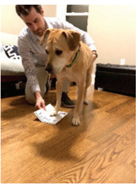
Figure 2. Dynamic shoulder adduction strengthening.